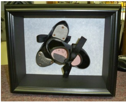
A father had us frame his adult daughter's tap shoes from when she took lessons as a child. Won't that bring back memories?

Displaying memorabilia in a frame enjoys tremendous popularity. Sports objects, collector's plates, medals, tap shoes and clothing pieces are just a few