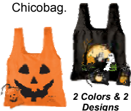
2 Colors & 2 Designs

There nothing better than a reusable bag & for Halloween there is nothing better then a reusable Chicobag.