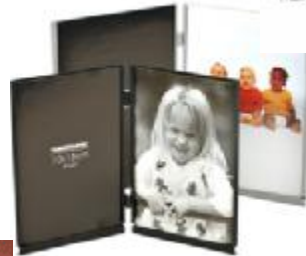
Ready-made picture frames