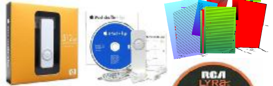
MP3 Players - iPod Shuffles, RCA Lyra and more.