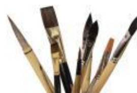
Art Materials Paints, Pads, Pallets, Paper & More