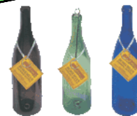
Incense Burners & Incense