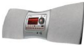
XM Radio & Accessories