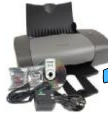
Computer Printers & Accessories